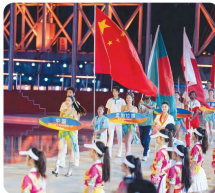
Flags of participating nations displayed during the closing ceremony