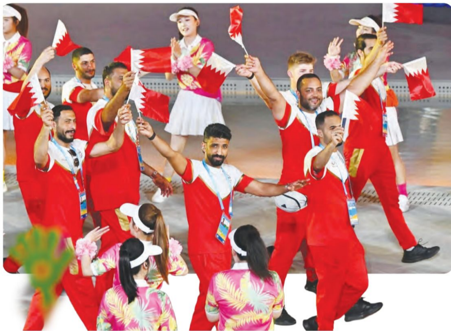
Bahrain's delegation carries the national flag during the parade

The Olympic Council of Asia President Sheikh Joaan bin Hamad Al Thani declared the Games closed as fireworks lit up the sky above Sanya Bay, marking the end of a multi-sport event that brought together more than 1,600 athletes from 45 OCA member countries. Competing across 14 sports, 15 disciplines and 62 events, the Games celebrated continental unity. In his closing remarks, Sheikh Joaan said: "Together, as one Asia, we have made history. United by our love of sport and a shared dream, we showed the very best of our continent."