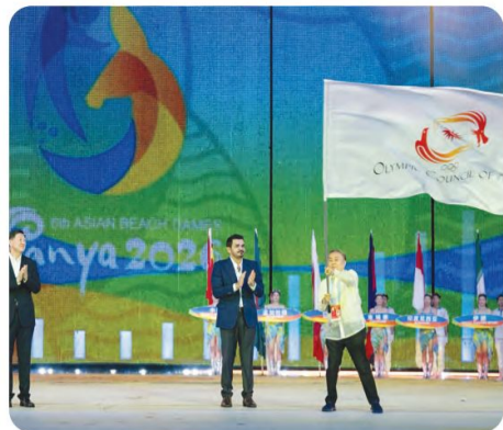
Flag handover ceremony