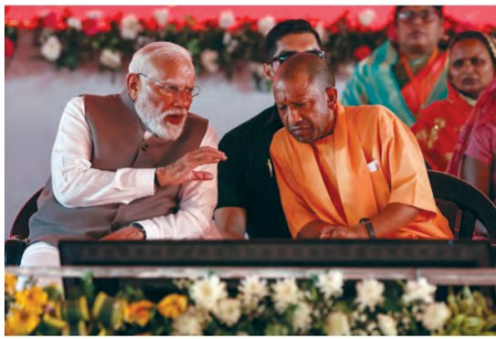
India's Prime Minister Narendra Modi (L) interacts with Uttar Pradesh's Chief Minister Yogi Adityanath during a public meeting for women in Varanasi

Prime Minister Narendra Modi's ruling party appeared set for gains in crucial state elections in India, according to exit polls released yesterday ahead of final results due on May 4. Exit polls have a patchy record in India, but they often show early markers of the final outcome. Elections in five states and territories have taken place in April including in the major opposition-held states of West