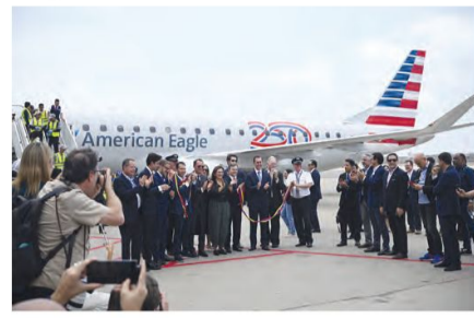
A ribbon in the colors of the Venezuelan flag is cut following the arrival of an American Eagle, operating a regional flight for American Airlines, aircraft at Simon Bolivar International Airport in La Guaira, La Guaira state, Venezuela