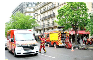
Paris fire brigade (BSP) operate after a fire in an apartment AFP | Paris

At least four people were killed that broke out in two separate Paris neighbourhoods, police sources and prosecutors said yesterday. Three bodies were found soon after 8:00 am (0600 GMT) in a seventh-floor flat near the Opera Garnier in the centre of the French capital. The blaze on the Boulevard des Italiens is believed to have started between 4:00 to 5:00 am. Those killed "couldn't get out of the window because of bars installed to prevent burglars getting in via the roof," said Ariel Weil, mayor of the city's four central districts. "Around 10 people living on the same floor were rescued by firefighters who got in through the roof," he added. Weil and a police source said investigators were looking into whether the fire could have started with a gas leak. Several firefighting vehicles were still on the scene by late morning, an AFP journalist saw, while central Paris prosecutors have opened an investigation.