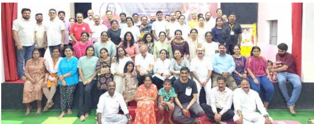
Participants in the program