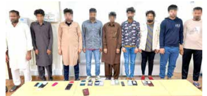
The suspects with evidence