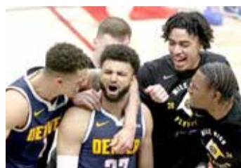
Jamal Murray celebrates his game-winning basket in Denver's series-clinching win over the Los Angeles Lakers

Murray finished with 32 points while team-mate Nikola Jokic had 25 points, 20 re-