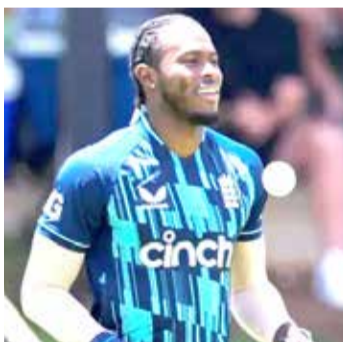
England paceman Jofra Archer reacts during a match (file photo)

He takes his place in a 15-man provisional squad captained by Jos Buttler for the tournament