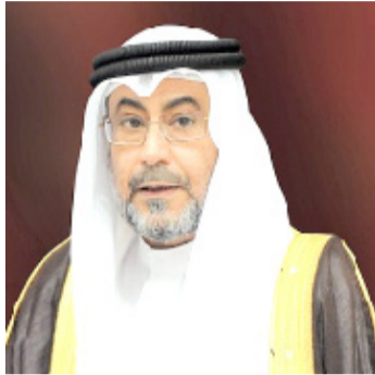
H.E. Ghanim Al Buainain