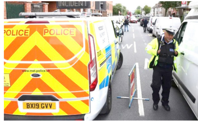
Police officers work at the scene of the attack (file photo) AFP | London

A 14-year-old boy died yesterday after a man wielding a sword stabbed the youth, two police officers and two other people, in a street attack in east London, police said. The man used what appeared to be a Samurai-type sword in the Hainault district shortly before 7:00 am (0600 GMT).