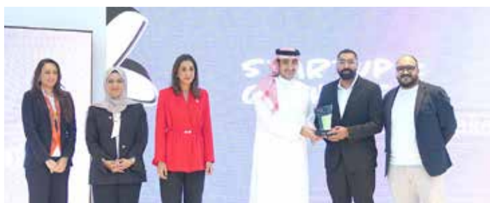
Shaikh Abdulla bin Khalifa Al Khalifa presents a memento to a winner

The primary objective of the 'Startup of the Year' competition, in its inaugural edition, is to spotlight emerging Bahraini ventures that have excelled in previous Startup Bahrain Pitch rounds. It offers these ventures a platform to showcase their