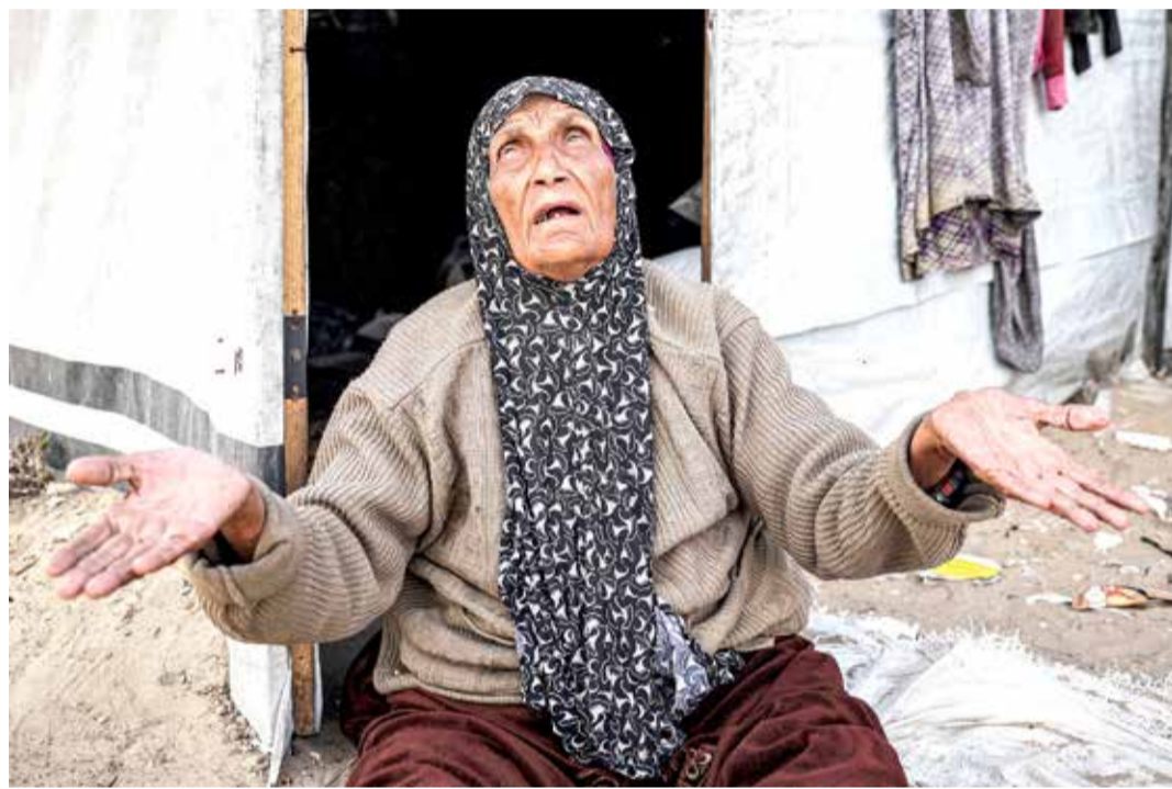
An elderly woman reacts as she sits outside a tent at a camp for displaced Palestinians in Rafah in the southern Gaza Strip.

The Palestinian group said it was considering a plan for a 40-day ceasefire and the exchange of scores of hostages for