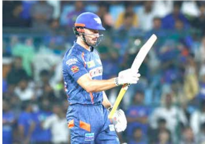
Marcus Stoinis reacts during the match

Lucknow moved to third spot in the 10-team table led by Rajasthan Royals. Five-time winners Mumbai remained ninth above wooden spooners Royal Challengers Bengaluru.