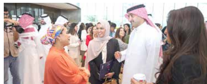
Officials discuss during the event