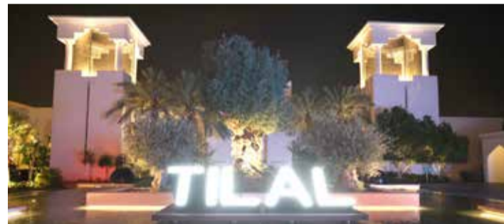
Arrival of the guests to the event