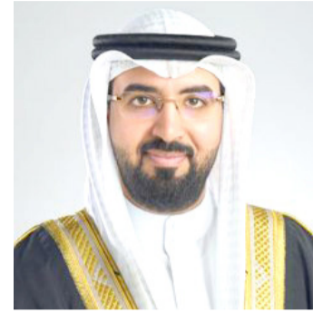
MP Hasan Ebrahim