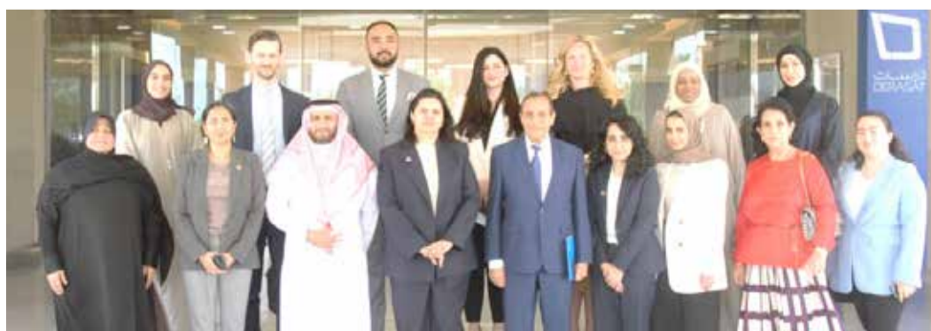
Participants in the dialogue session

opportunity to express their opinions, contribute ideas, and discuss potential collaborations in support of sustainable development initiatives.