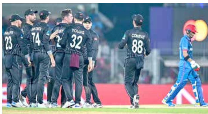
New Zealand's Matt Henry (L, center) celebrates with teammates after taking the wicket of Afghanistan's Rahmanullah Gurbaz (R)

New Zealand said they will play a one-off Test against Afghanistan at a venue yet to be decided.