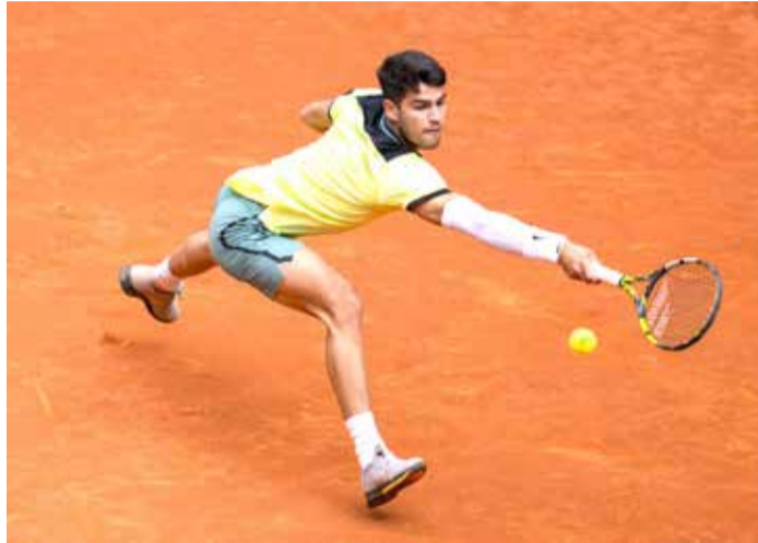
Carlos Alcaraz in action

Quarters next," wrote the former world number one on the camera lens after the match.