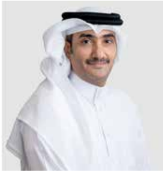
Shaikh Abdulla bin Khalifa Al Khalifa

Isa Al Khalifa, and the effective government policies and plans spearheaded by His Royal Highness Prince Salman bin Hamad Al Khalifa, the Crown Prince and Prime Minister.