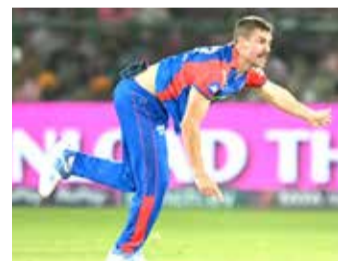
Anrich Nortje in action (file photo)

But Walter said he backed the quality of the player who