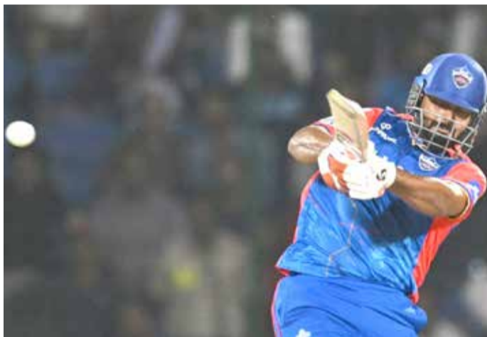
Rishabh Pant plays a shot during IPL

Pant had termed his comeback to the game as "nothing short of a miracle" after a road crash in December 2022, when his Mercedes rammed into a barrier, flipped and caught fire near New Delhi.