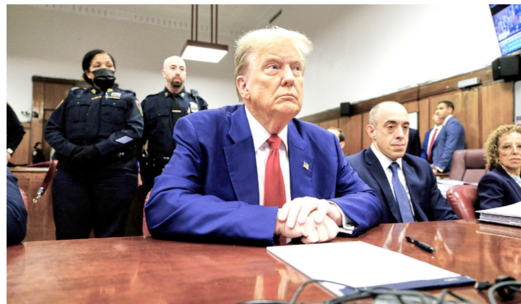
Former US President Donald Trump arrives to attend his trial at Manhattan Criminal Court in New York City

The New York judge presiding over Donald Trump's hush money trial fined the former president yesterday for defying a gag order and warned that further violations could see him thrown in jail. Trump, 77, is accused of falsifying business records to reimburse his lawyer, Michael Cohen, for a $130,000 payment made to porn star Stormy Daniels just days ahead of the 2016 election against Hillary Clinton.