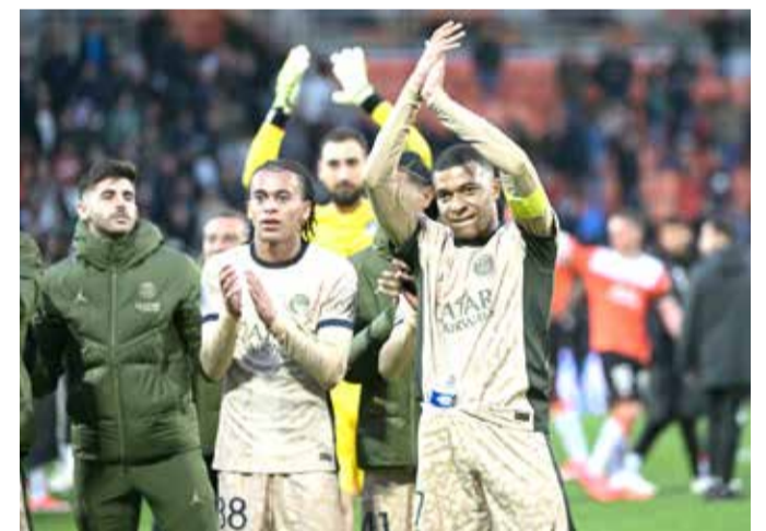
Paris Saint-Germain's Kylian Mbappe (R) applauds the crowd next to his brother Ethan Mbappe (2L)