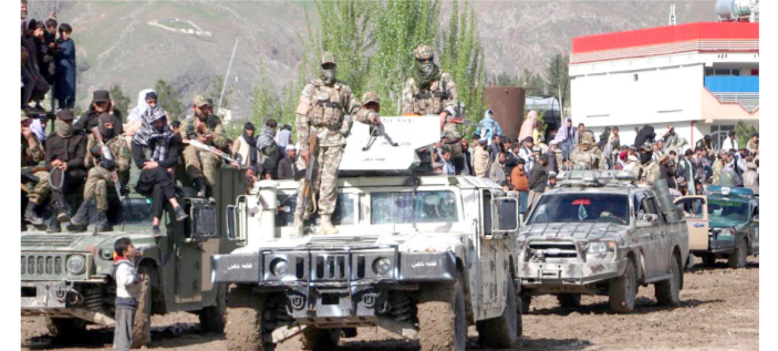
Taliban security personnel stand guard atop a Humevee vehicle AFP | Kabul