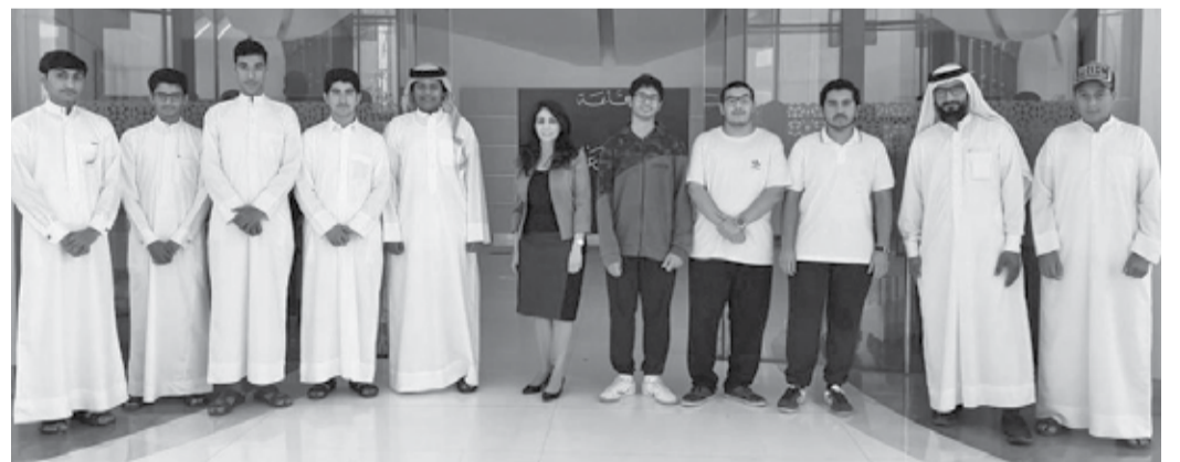
Al Iman School students during their visit to Al Jawhara Centre