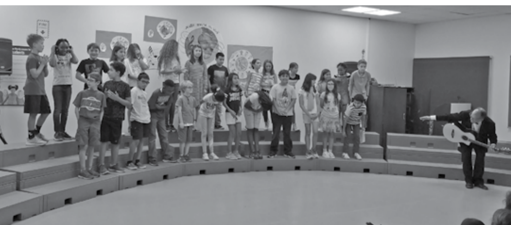
Students of Bahrain School during a performance

The evening concluded with student recognition and awards and was attended by a very large number of students, parents and teachers.