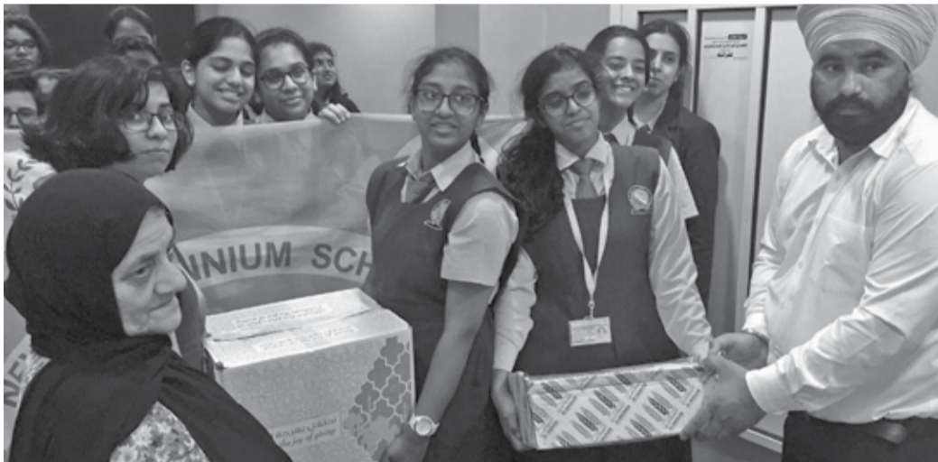
Students of commerce stream of New Millennium School-DPS during a visit to the Al Eshah Society to donate 20 boxes of grocery items for the needy families as part of a charity drive. The students interacted with the Bahraini families and enhanced their understanding of the Bahraini culture as well as imbibed the true essence of Ramadan

For more details and application form please visit www.bksbahrain.com .