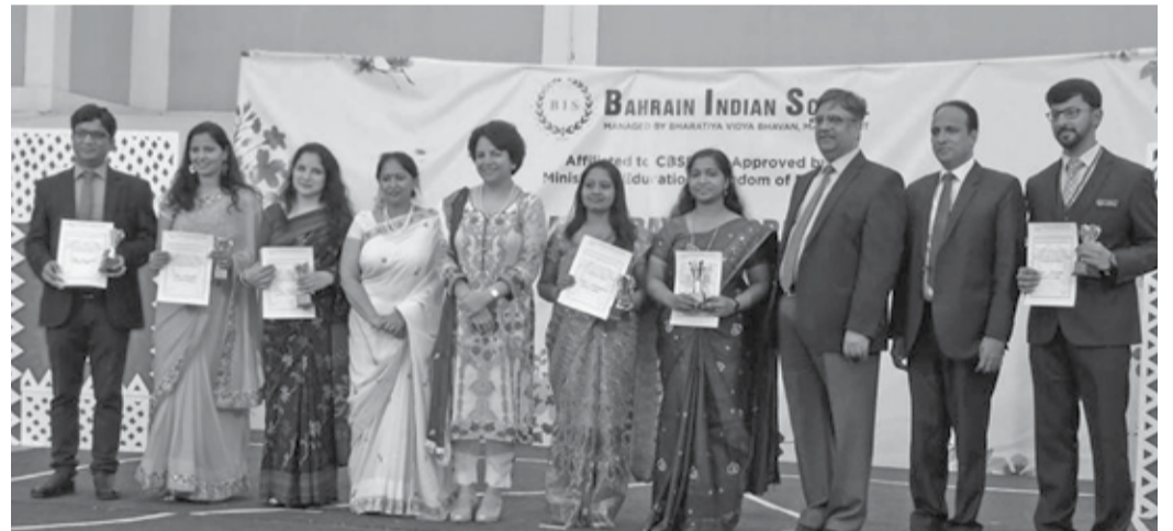
Students and staff of Bahrain Indian School (BIS)-Bhavans during the Foundation Day celebration. The event was organised by the school to celebrate its five years of existence in the Kingdom. The occasion recollected the memories in these five years through a short movie followed by a cultural program by students and teachers. Students were awarded for their academic excellence for the last academic year as well as for 100 per cent attendance