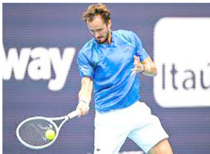
Daniil Medvedev of Russia returns a shot during the men's quarter-final match against Christopher Eubanks of the US

He will be up against Italian tenth-seed Jannik Sinner next as he seeks to complete the 'Sunshine Double' following his triumph over Medvedev at Indian Wells.