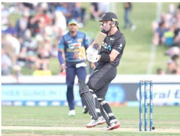
New Zealand's Will Young plays a shot

Sri Lanka are ninth, outside the top eight who automatically