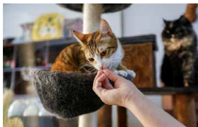
A worker feeds a cat at the Ailuromania Cat Cafe

She said she appreciates how the cafe looks after the cats' welfare by advising people not to hold them or wake them up.