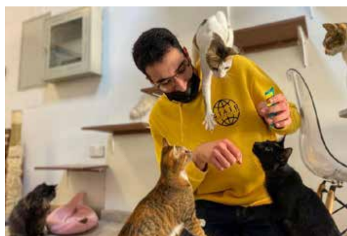
A man plays with the cats at the Ailuromania Cat Cafe