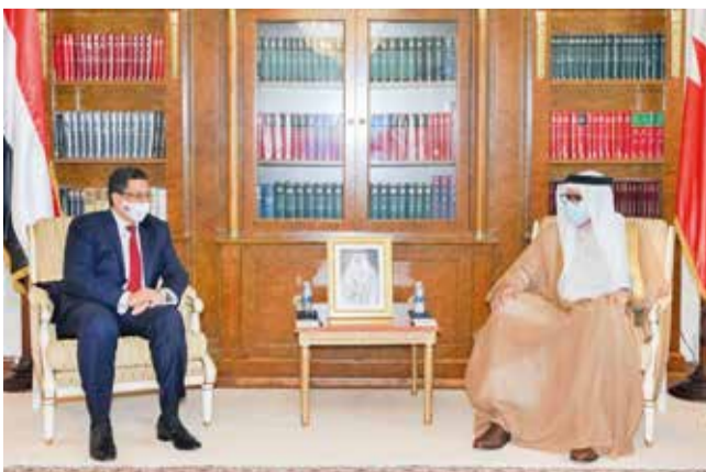
Foreign Affairs Minister Dr Abdullatif bin Rashid Al Zayani received yesterday Yemeni Minister of Foreign Affairs and Expatriates, Ahmed Awad bin Mubarak. Minister Al Zayani praised fraternal relations between the Kingdom of Bahrain and Yemen, affirming the Kingdom's keenness to further develop bilateral ties for the benefit of both countries and people. He also expressed the Kingdom's solidarity with the Yemeni government, highlighting its support to restoring legitimacy and liberating the Yemeni territories from the Houthi militias, defending Yemen's sovereignty, and combating all foreign interference in Yemen.