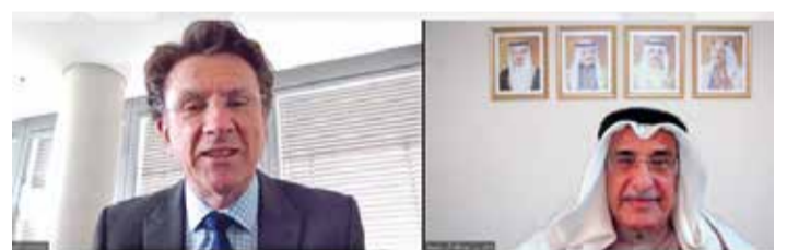
The Deputy Prime Minister with the EDB Advisor during a virtual meeting