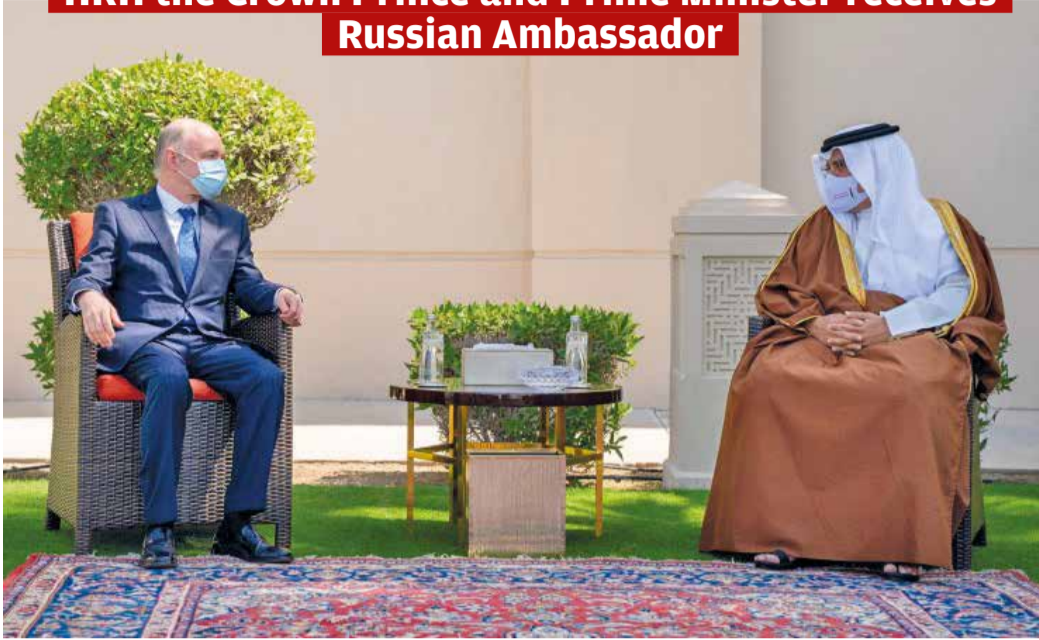
His Royal Highness Prince Salman bin Hamad Al Khalifa, the Crown Prince and Prime Minister, yesterday received Russian Ambassador Igor Kremnev at Riffa Palace. His Royal Highness noted that growing bilateral ties have created new avenues for cooperation, particularly in relation to COVID-19 vaccination and mitigation efforts. The Ambassador expressed his appreciation for the support His Royal Highness has extended to enhancing bilateral relations.