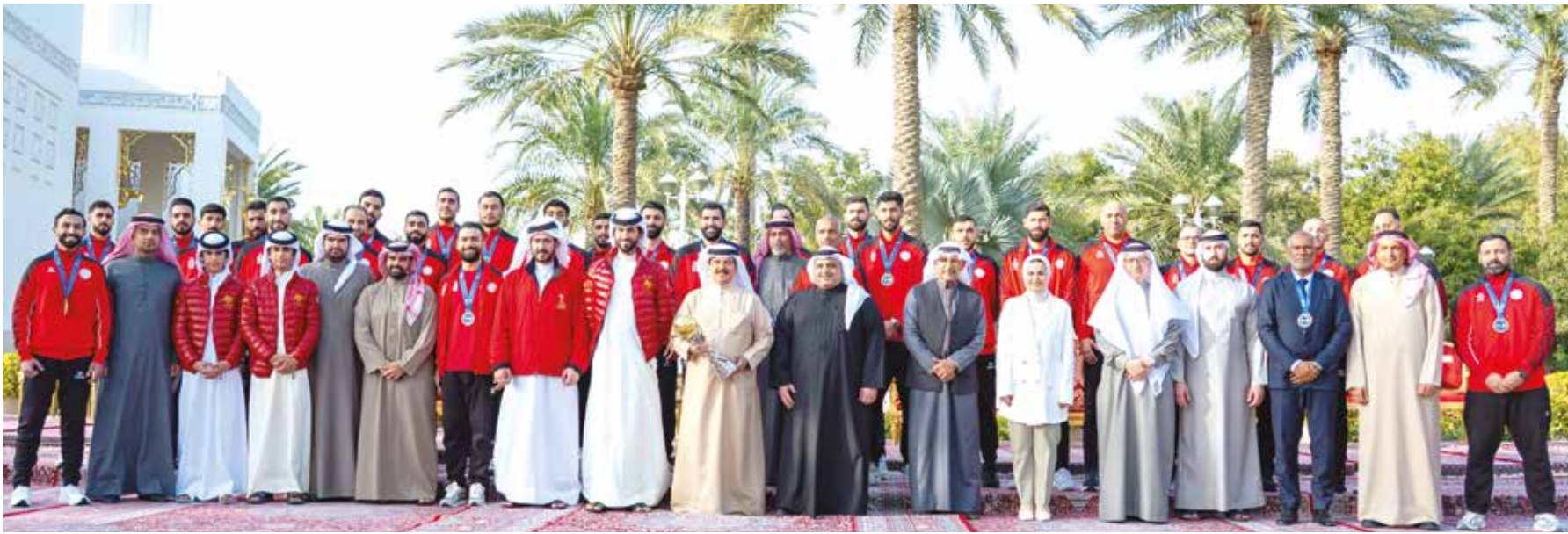
HM the King receives the victorious national handball team

HM King Hamad grants housing units to handball team for historic Asian Championship victory