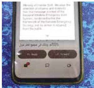
A trial operation of the Emergency Alert System