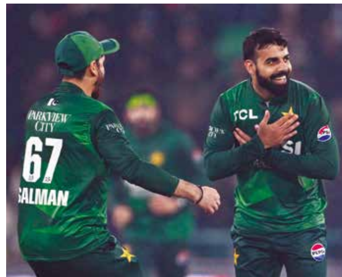
Pakistan's players celebrate after the dismissal of Australia's Cooper Connolly during the second Twenty20 international cricket match between Pakistan and Australia at the Gaddafi Cricket Stadium in Lahore