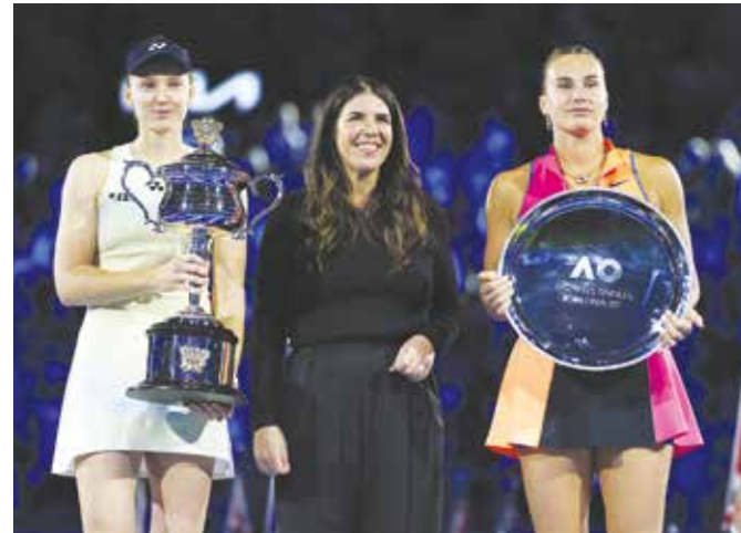
Kazakhstan's Elena Rybakina (L) celebrates with the Daphne Akhurst Memorial Cup after her victory against Belarus' Aryna Sabalenka (R) during the women's singles final match on day fourteen of the Australian Open tennis tournament in Melbourne