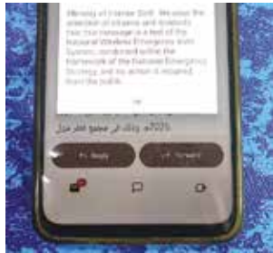
A trial operation of the Emergency Alert System