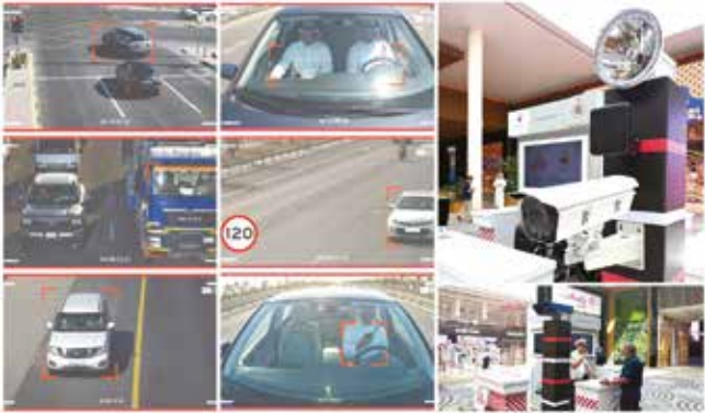
Smart camera system will go live today to track violations