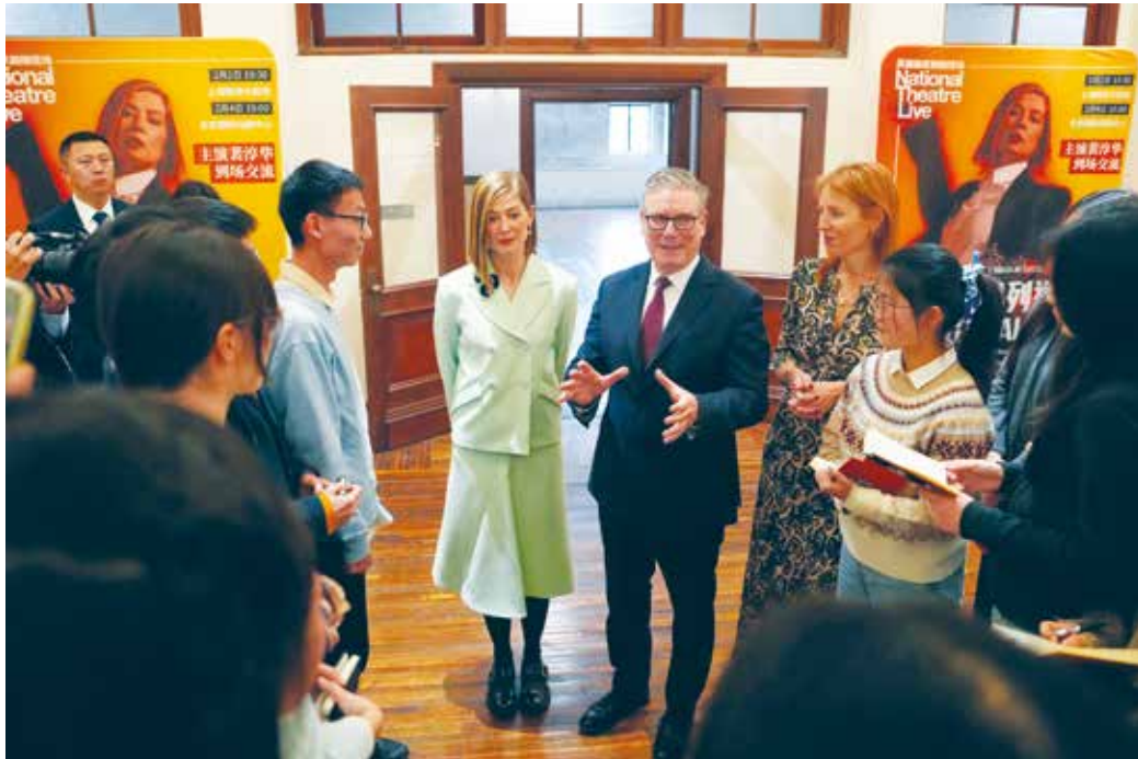
Britain's Prime Minister Keir Starmer and British actor-producer Rosamund Pike meet with Chinese performing arts students at the Design Innovation Institute Shanghai, in Shanghai

● Starmer met with Chinese officials, including Xi, on Thursday.