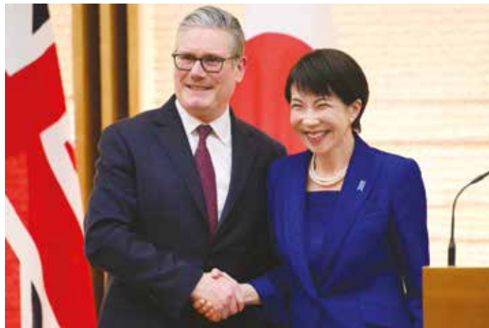
Japan's Prime Minister Sanae Takaichi (R) and Britain's Prime Minister Keir Starmer shake hands

"President Xi tells the story of blind men being presented with an elephant. One touches