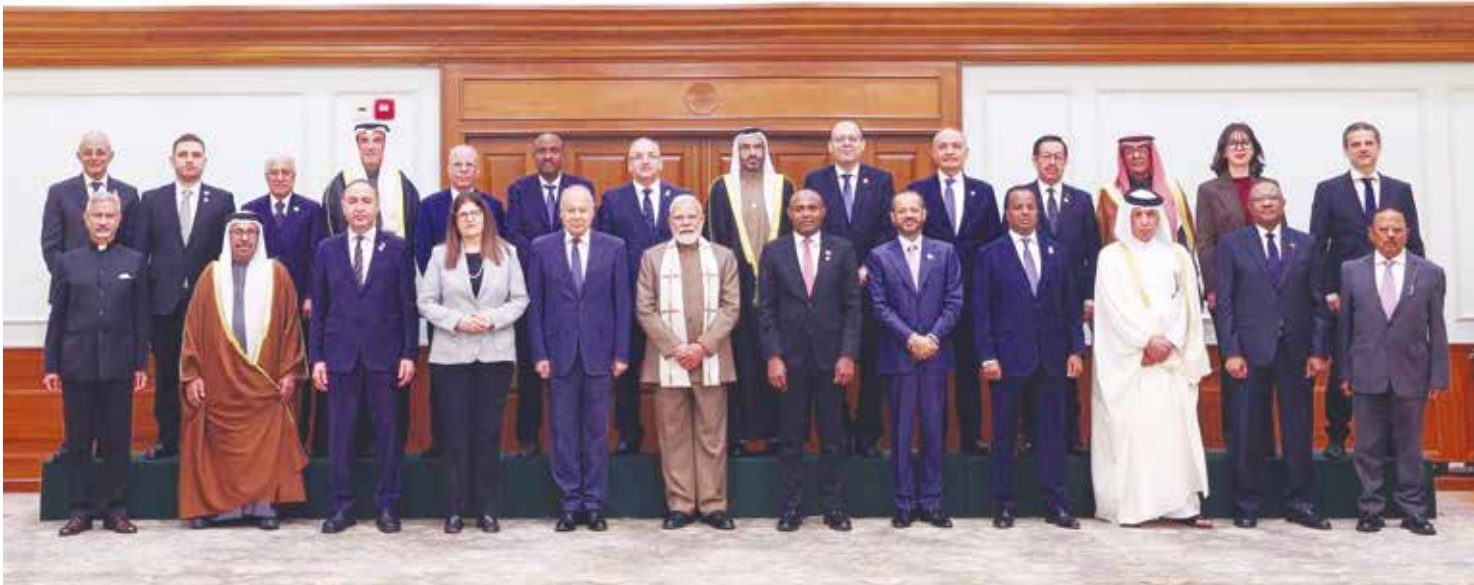
Modi with Foreign Ministers and delegations of the Arab League yesterday.

The expert look-over will "determine the nature of the works carried out on the updated painting inside one of the chapels of San Lorenzo in Lucina and decide what further steps might be taken", he said in a statement.