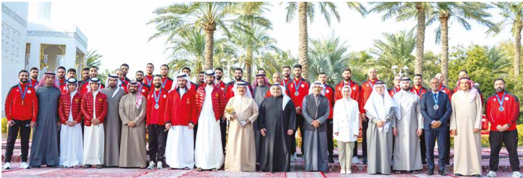
HM the King receives the victorious national handball team

HM King Hamad grants housing units to handball team for historic Asian Championship victory