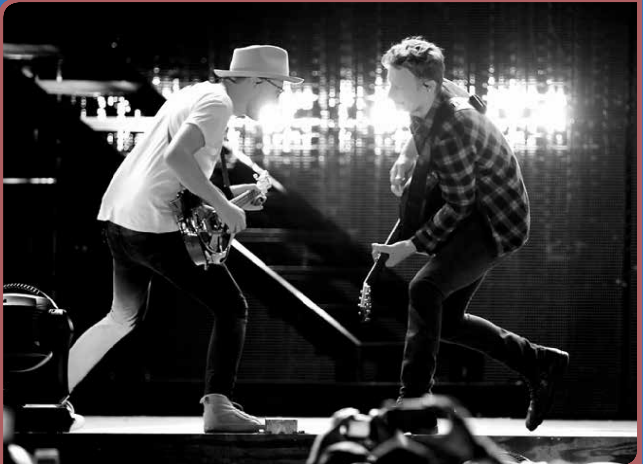
Singer/Songwriter Dierks Bentley (R) performs on the Toyota Mane Stage during day 1 of 2017 Stagecoach California's Country Music Festival at the Empire Polo Club yesterday in Indio, California