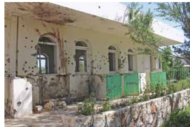
A damaged mosque near the army compound outside Mazar-i-Sharif in Balkh province after Taliban attack

The annual spring offensive normally marks the start of the "fighting season", though this winter the Taliban continued to battle government forces, most successfully in last week's attack on the military base outside the northern city of