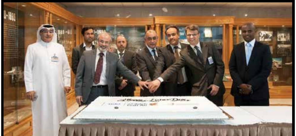
Gulf Air, in collaboration with Bahrain Airport Company (BAC), the managing body and operator of Bahrain International Airport (BIA) and Gulf Aviation Academy (GAA) celebrated international Labour Day with a staff appreciation ceremony at the airline's Muharraq headquarters