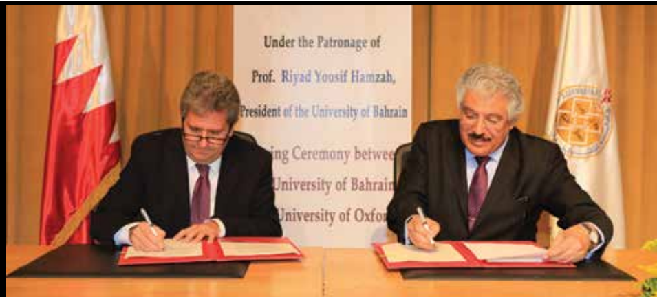
University of Bahrain signed two research cooperation agreements with two renowned British universities as a fruitful outcome of the scientific cooperation forum organised by the British Council in February and November 2016. The forum discussed water, energy and food issues. Water desalination and reuse technologies, with the participation of local, Gulf and British researchers, were discussed