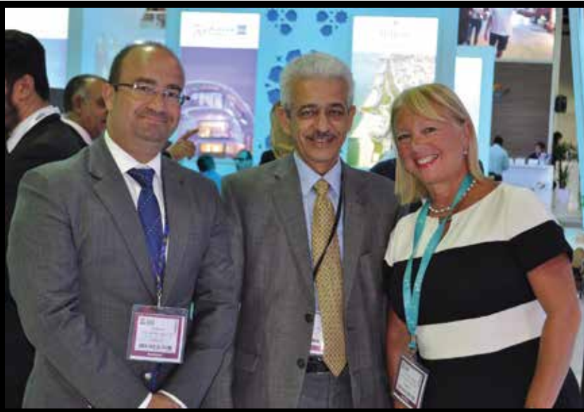
The Bahrain Tourism and Exhibitions Authority (BTEA) celebrated its successful participation in the Arabian Travel Market (ATM), which was held at the Dubai International Convention and Exhibition Centre from 24 to 27 April. BTEA hosted hundreds of guests and held a number of meetings with various government agencies and private companies