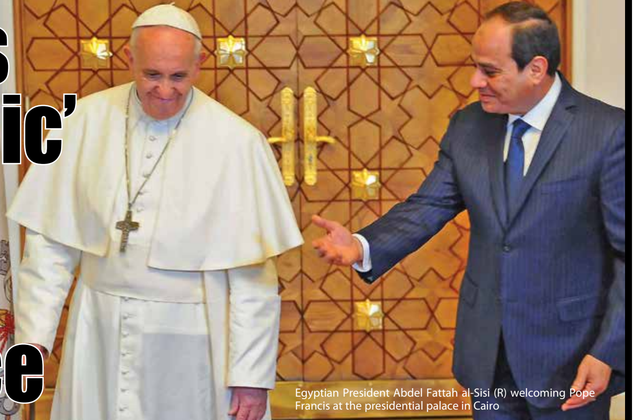
Egyptian President Abdel Fattah al-Sisi (R) welcoming Pope Francis at the presidential palace in Cairo

Cairo Pope Francis denounced "demagogic populism" yesterday and insisted that violence profanes God's name, in a wide-ranging speech as he visited Egypt to push for tolerance. "Peace alone... is holy and no act of violence can be