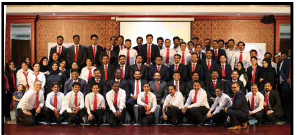
UAE Exchange Bahrain in tune with their #SayWow Campaign organised a Felicitation Event for their staffs "Radiance", where various initiatives were launched to support Employee Growth and Employee Engagement. Top Performers of the year 2016 were rewarded on the occasion