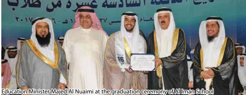
Education Minister Majed Al Nuaimi at the graduation ceremony of Al Iman School

The minister who was patronising the graduation ceremony in the presence of parents, relatives and school officials said that Al Iman had been steadily improving the performance of its students and that this year, it accomplished an outstanding score in the reading challenge competition, by ranking among the top three, selected from 30,000 schools that participated from across the Arab world. Al Nuaimi stressed that the