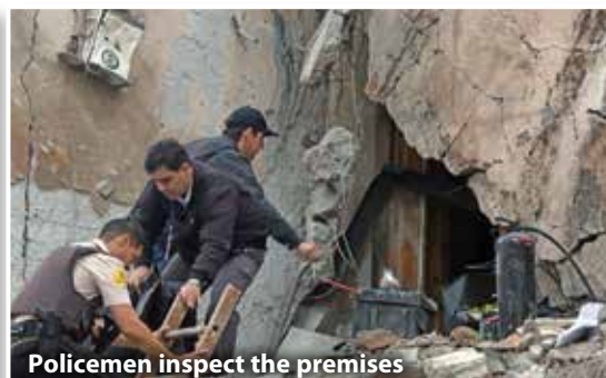
Policemen inspect the premises