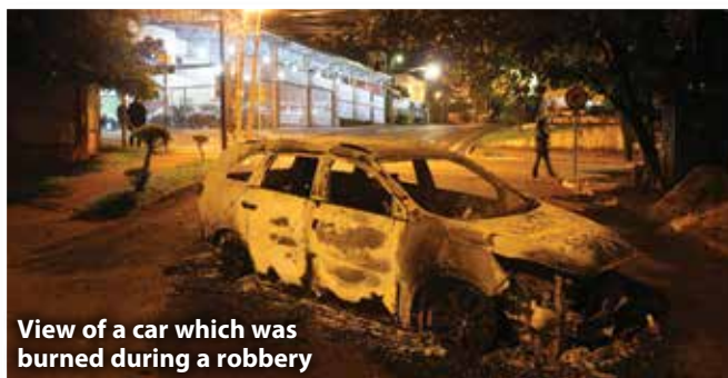
View of a car which was burned during a robbery

As many as 50 people were reported by police Monday to have participated in the attack. They included members of First Capital Command, one of Brazil's most powerful drug gangs, which is based in Sao Paulo and has fought turf battles in Rio de Janeiro and across the country's prison system.