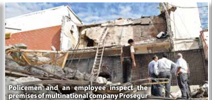
Policemen and an employee inspect the premises of multinational company Prosegur

Gang steals millions in stunning Paraguay heist