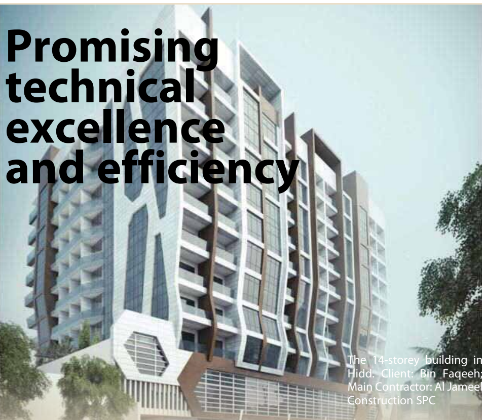
The 14-storey building in Hidd. Client: Bin Faqeeh; Main Contractor: Al Jameel Construction SPC

Adnan Gate Contracting W.L.L., through its wealth of experience and knowledge, has earned a reputation for technical excellence, integrity and efficiency and has won appreciation for quality, safety and innovation.