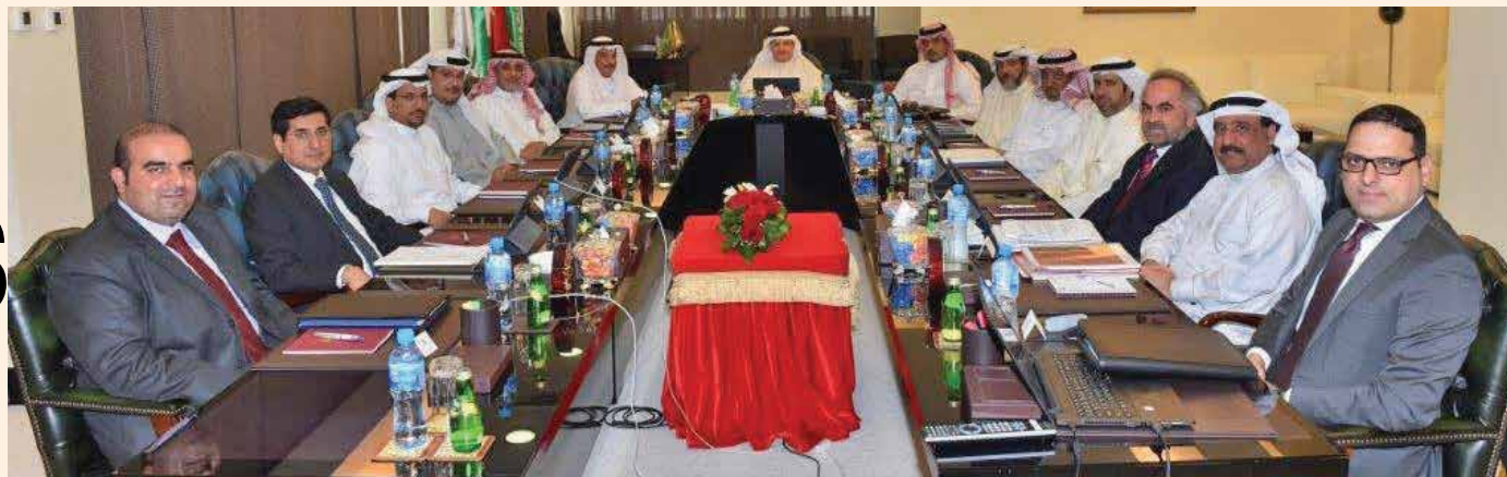
GPIC holds Ordinary General Meeting

Manama Gulf Petrochemical Industries Company (GPIC) exceeded all its production targets for the year 2016 and achieved new records without a lost time accident, it was announced.