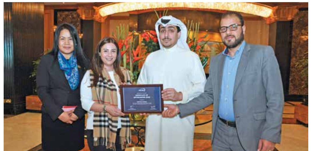
Gulf Hotel and Destinations of the World Certificate Award officials during the ceremony