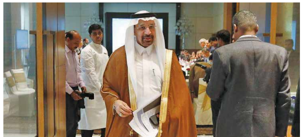
Saudi Arabia's Energy Minister Khalid al-Falih (C) leaves after a meeting in New Delhi, India

Falih said OPEC was determined to translate the