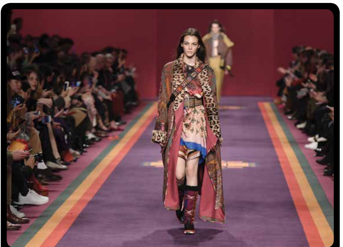
A model presents a creation for fashion house Etro during the Women's Fall/Winter 2017/2018 fashion week in Milan, yesterday.