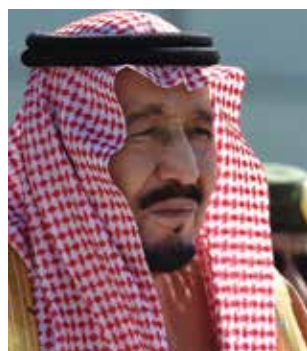
King Salman bin Abdulaziz