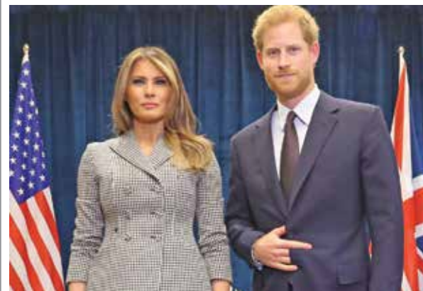
Prince Harry poses with U.S. first lady Melania Trump for the first time as she leads the USA team delegation ahead of the Invictus Games 2017