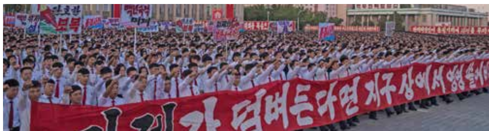
Students march during a mass rally on Kim Il-Sung square in Pyongyang

Pyongyang Tens of thousands of Pyongyang residents were gathered in the capital's Kim Il-Sung Square yesterday to laud leader Kim Jong-Un's denunciation of US President Donald Trump.