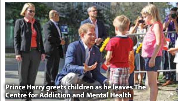
Prince Harry greets children as he leaves The Centre for Addiction and Mental Health

Since the "Suits" actress, 36, told Vanity Fair the couple are "in love" last month, fans and the press have been eagerly awaiting an official appearance.