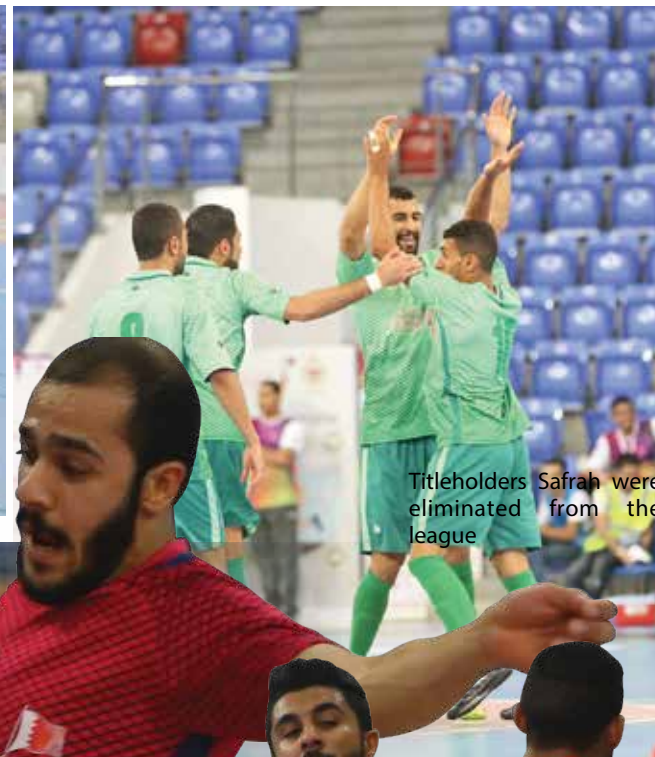
Titleholders Safrah were eliminated from the league

Council for Youth and Sports and Honorary President of Bahrain Sports Federation for Disabilities and organised by the Ministry of Youth and Sports Affairs and the Media Office of Shaikh Khalid bin Hamad Al Khalifa, under the slogan #Generations_Meeting.