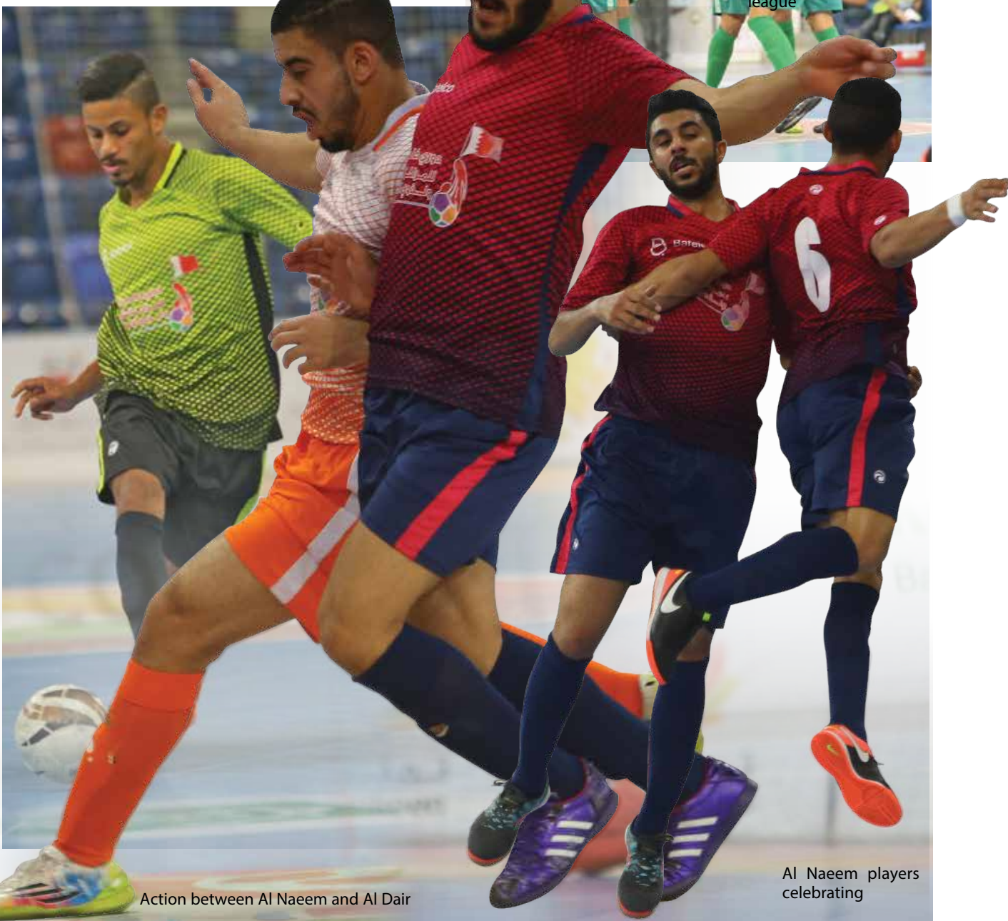
Action between Al Naeem and Al Dair

It started on July 24 and continues until September 14 and features 59 teams, divided into 36 youth centres teams, 9 unregistered clubs, 8 teams of people with disabilities institutions and 6 girls teams.