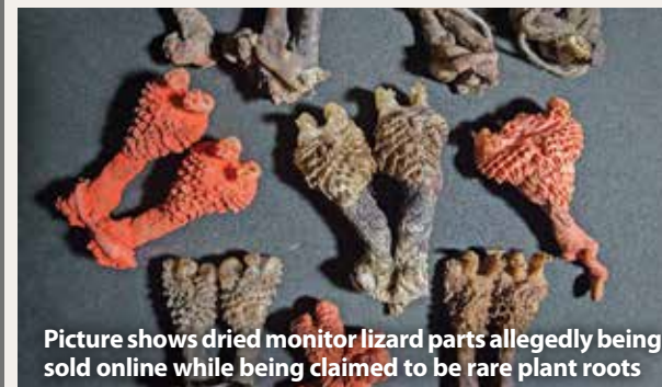
Picture shows dried monitor lizard parts allegedly being sold online while being claimed to be rare plant roots