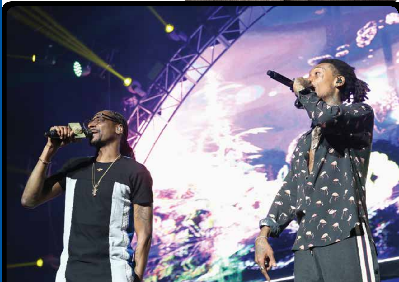
Recording artists Snoop Dogg (L) and Wiz Khalifa perform onstage at night one of the 2017 BET Experience STAPLES Centre Concert, sponsored by Hulu, at Staples Centre yesterday in Los Angeles, California