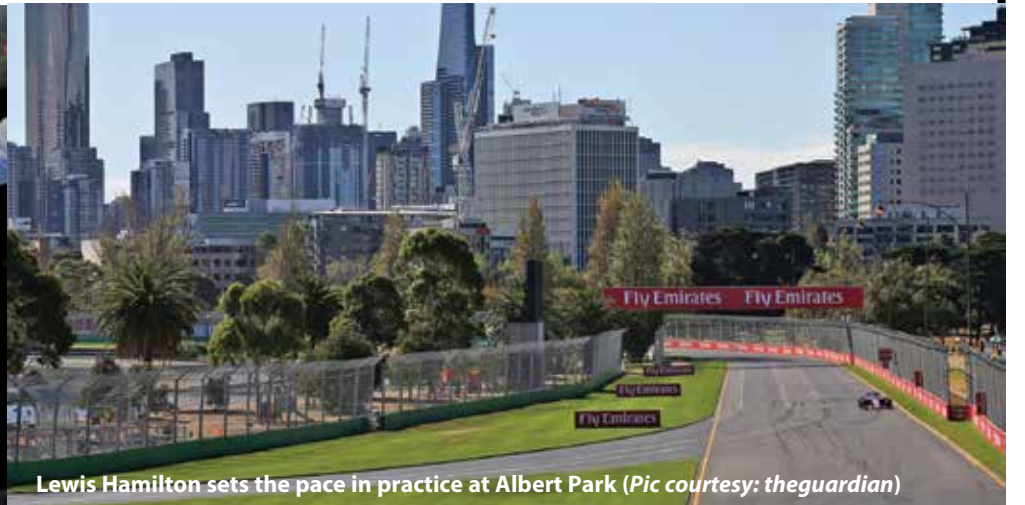
Lewis Hamilton sets the pace in practice at Albert Park