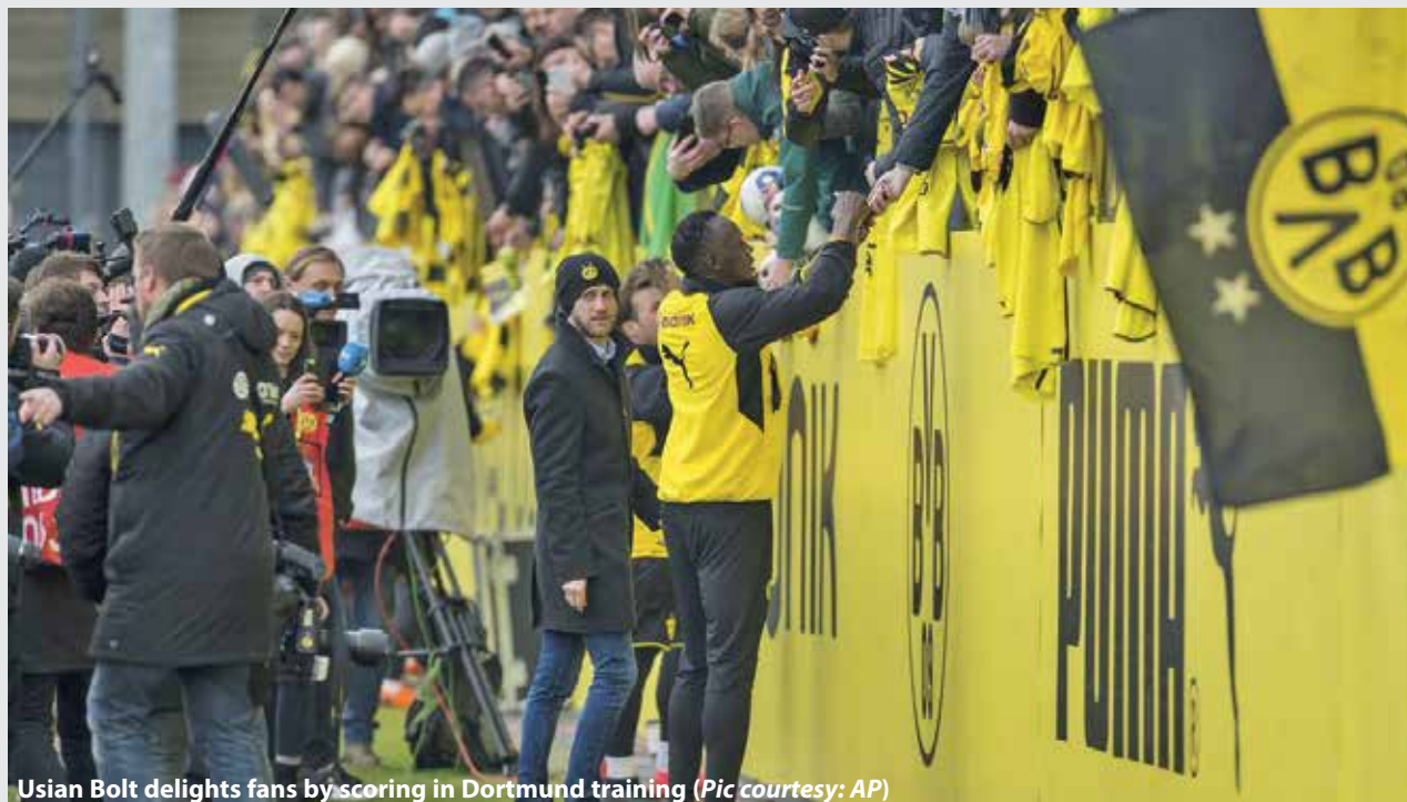
Usain Bolt delights fans by scoring in Dortmund training

Dortmund, who are not in action until March 31 due to the international break, share the same sponsor, Puma, as Bolt, and had agreed in January to let the retired athlete train with the team. (Reuters)