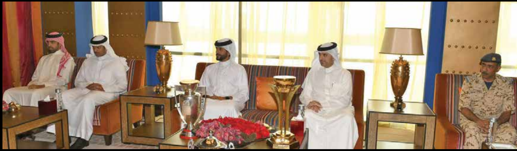
HH Shaikh Nasser bin Hamad Al Khalifa, Representative of His Majesty the King for Charity Works and Youth Affairs, Chairman of the Supreme Council for Youth and Sports, President of Bahrain Olympic Committee, welcomed to his office several winners representing national clubs and youth delegations, who won top places in the youth and sports sectors, in the presence of Hisham Al-Jowdar, Minister of Youth and Sports Affairs. On this occasion, Shaikh Nasser underscored the remarkable achievements established by Bahraini youth, stressing the support of the Kingdom's leadership. Shaikh Nasser stated that rewarding young people who won top honours is in line with HM the King's directives