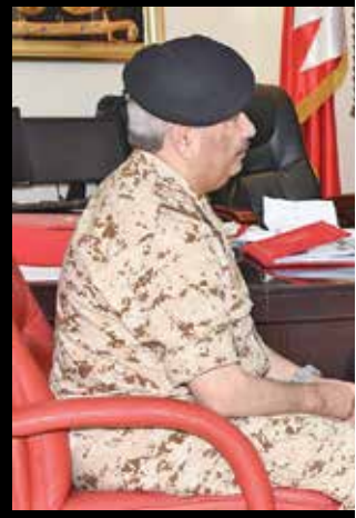
BDF Commander-in-Chief, Field Marshal, visited a number of BDF units, where he inspected their progress