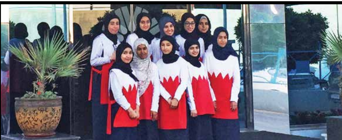
Royal Bahrain Hospital (RBH) celebrated Mother's Day on March 21, 2017 in a unique way. RBH hosted female students from Khawla Secondary School at its maternity ward, who in turn congratulated the mothers and distributed gifts on behalf of the school.