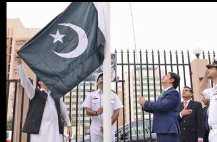
Pakistan's Ambassador Javed Malik hoisting flag at Pakistan Embassy in Bahrain on Pakistan Day