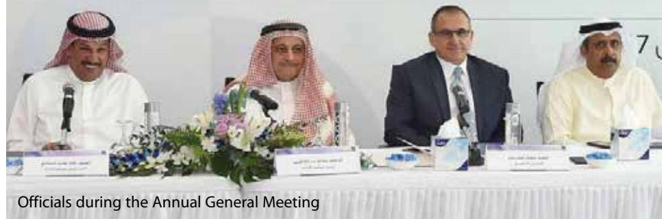
Officials during the Annual General Meeting