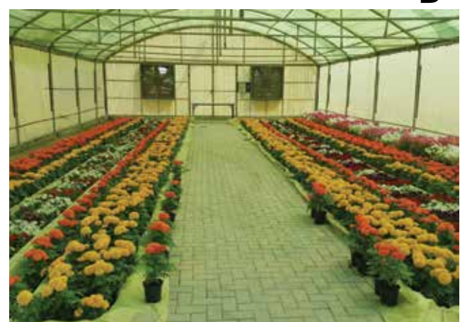
Rows of flowers set ready for the exhibition

he first edition of the flower The first equion of the show opens its doors today in Hoorat A'ali.