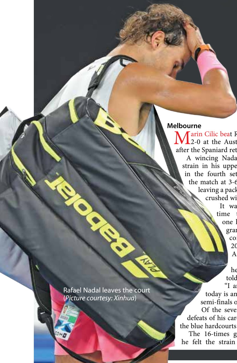
Rafael Nadal leaves the court

"It was an unbelievable performance from both of us and it's really unfortunate for Rafa," Cilic told Jim Courier during his post-match interview. (Eurosport)