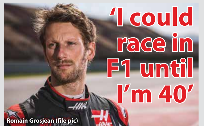
Romain Grosjean (file pic)