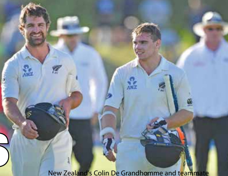
New Zealand's Colin De Grandhomme and teammate