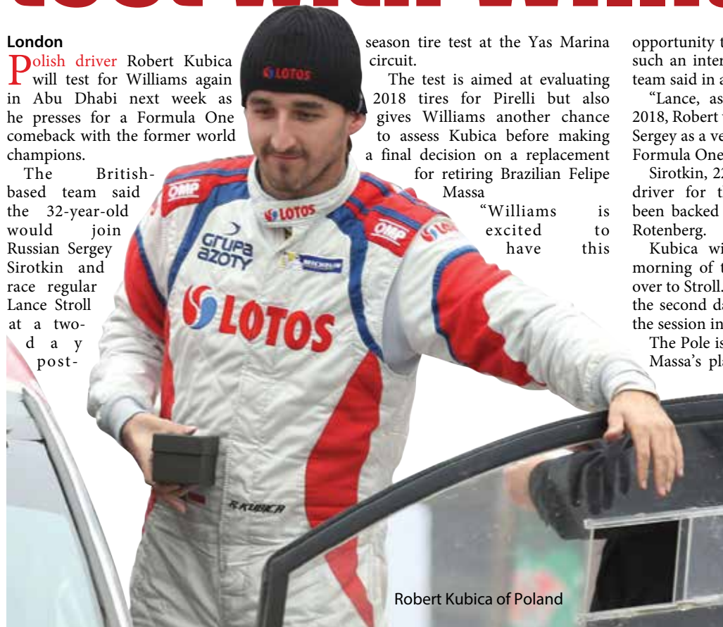
Robert Kubica of Poland

He has twice tested a 2014 Williams car this year after failing to secure a seat at Renault.