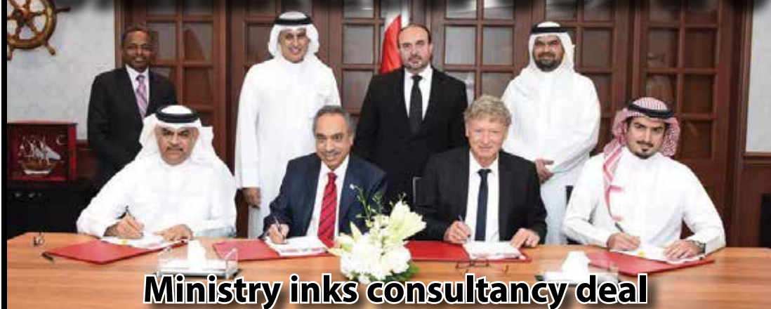
Ministry inks consultancy deal