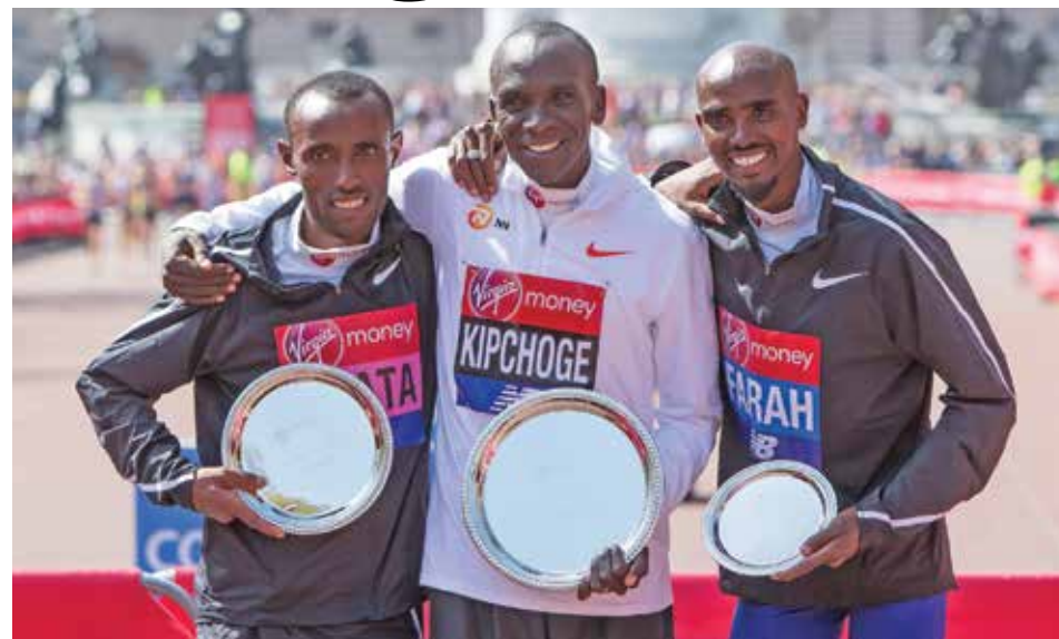
Medallists Eliud Kipchoge (C) of Kenya, Tola Shura Kitata (L) of Ethiopia and Mo Farah of Britain celebrate

Ethiopia's Tola Shura Kitata finished in a surprise second place, 32 seconds behind