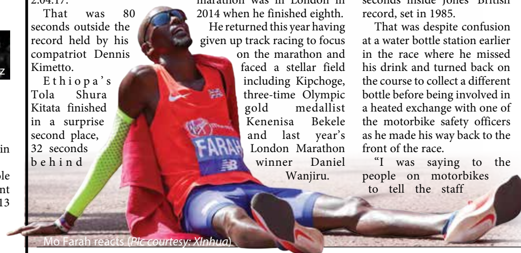
Mo Farah reacts

"You get heavy legs. Mentally you need to be strong and pace yourself." (BBC)