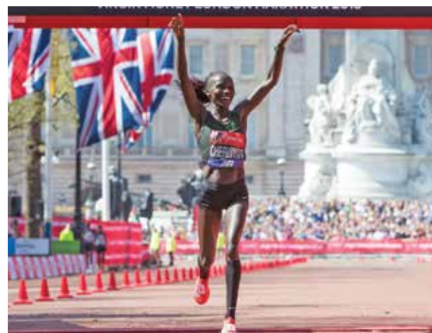
Vivian Cheruiyot crosses the finish line

Olympic 5,000m champion Cheruiyot ran her first marathon in London last year and finished fourth overall