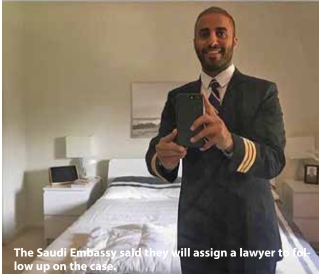
The Saudi Embassy said they will assign a lawyer to follow up on the case.