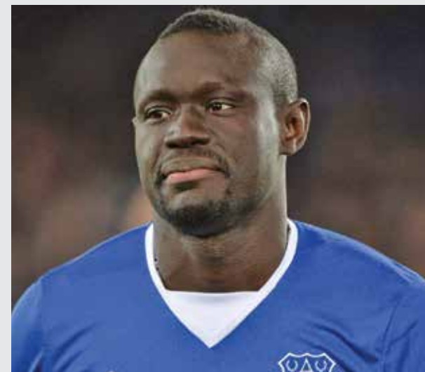
Oumar Niasse (file pic)

Manchester City forward Bernardo Silva and Watford's Richarlison have both avoided charges this season. (BBC)