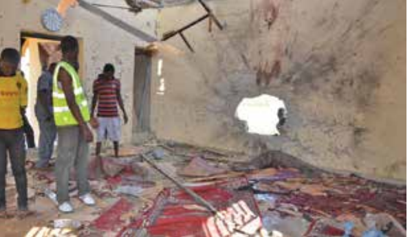
A suicide bomber has attacked a mosque during early morning prayers in Nigeria.