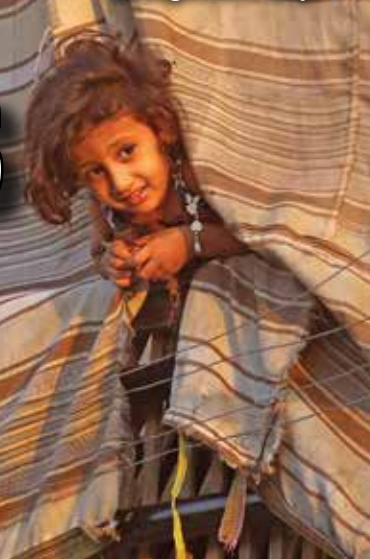
A displaced Syrian child who fled the Islamic State (IS) group's Syrian stronghold of Raqa

Raqa Syrian fighters backed by US special forces battled yesterday to clear the last remaining Islamic State group jihadists holed up in their crumbling stronghold of Raqa.