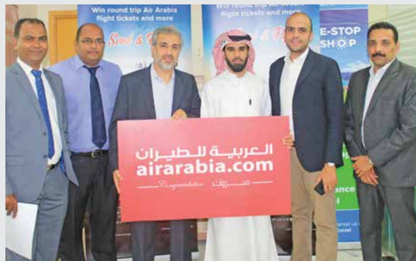
UAE Exchange in association with Xpress Money and Air Arabia held the Final draw for "Send & Fly promotion" on 17th September 2017. Officials from MOIC, Xpress Money, Air Arabia and UAE Exchange were present during the event. Winners were rewarded with 20 Air tickets and 20 gift vouchers (Promotion period: 10th July- 09th September 2017).