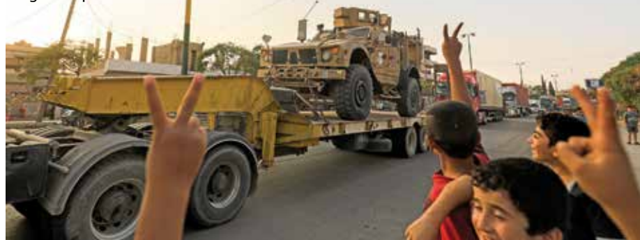
Children flash the victory gesture as a military convoy carrying US-made Oshkosh armoured vehicles, bulldozers, and arms headed for Syrian Democratic Forces (SDF) fighting in Raqa

IS seized Raqa in early 2014, making it their de facto Syria capital. They are thought to have used the city to plan attacks abroad. (AFP)