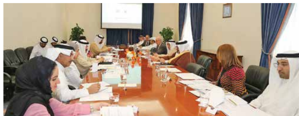
The meeting held to review the current Government Action Plan