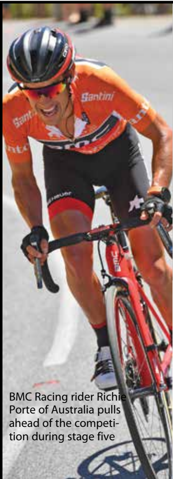
BMC Racing rider Richie Porte of Australia pulls ahead of the competition during stage five