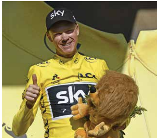
Great Britain's Christopher Froome celebrates his overall leader yellow jersey on the podium

"He's got the engine to ride with the best in world and he's certainly capable of coming back to contest the overall victory."