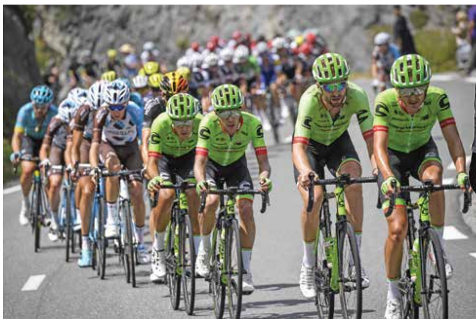
Riders of the USA's Cannondale Drapac cycling team (From R) Australia's Simon Clarke, USA's Taylor Phinney, Colombia's Rigoberto Uran and USA's Andrew Talansky ride during the 179.5 km eighteenth stage of the 104th edition of the Tour de France cycling race yesterday between Briancon and Izoard, French Alps