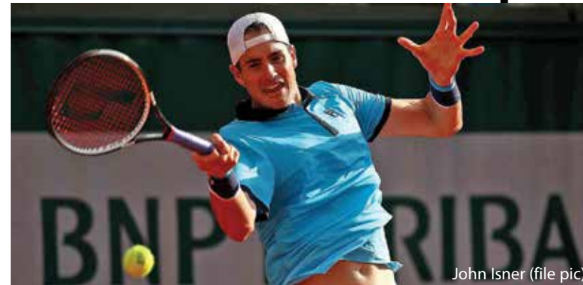
John Isner (file pic)

Washington U S top seed John Isner and second-seeded defending champion Ivo Karlovic advanced to the quarter-finals of the ATP Hall of Fame Championships with straight-set triumphs Wednesday at Newport, Rhode Island. Isner, the 2011 and 2012 winner at the grass-court event, fired 13 aces in defeating Australian qualifier Sam Groth 6-2, 6-4. The hard-serving American improved to 3-0 all-time against Groth, who dropped prior meetings in Davis Cup ties this year and last year, with the 61-minute triumph. Croatia's Karlovic, 38, defeated American Denis Kudla 6-4, 6-4 to reach the final eight. Karlovic, seeking his ninth career ATP crown, lost the 2014 and 2015 Newport finals before downing Gilles Muller 14-12 in a third-set tie-breaker to win last year's championship