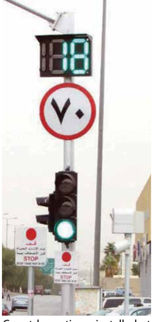
Countdown timer installed at a traffic signal in Saudi Arabia

This proposal is aimed at maintaining traffic safety and reducing accidents and violations near junctions," Al Maarifi said.