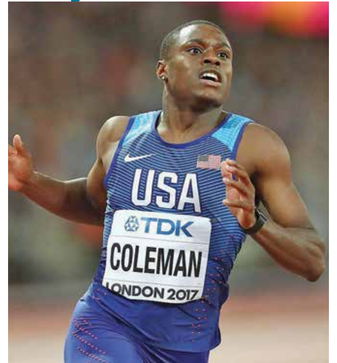
Christian Coleman (file pic)