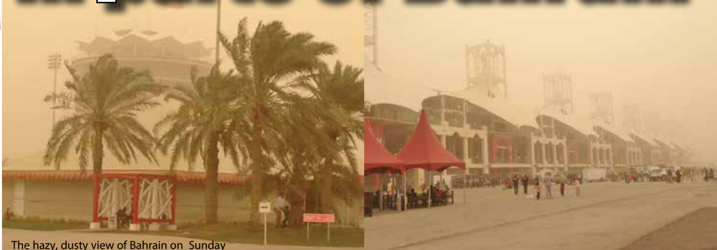
The hazy, dusty view of Bahrain on Sunday