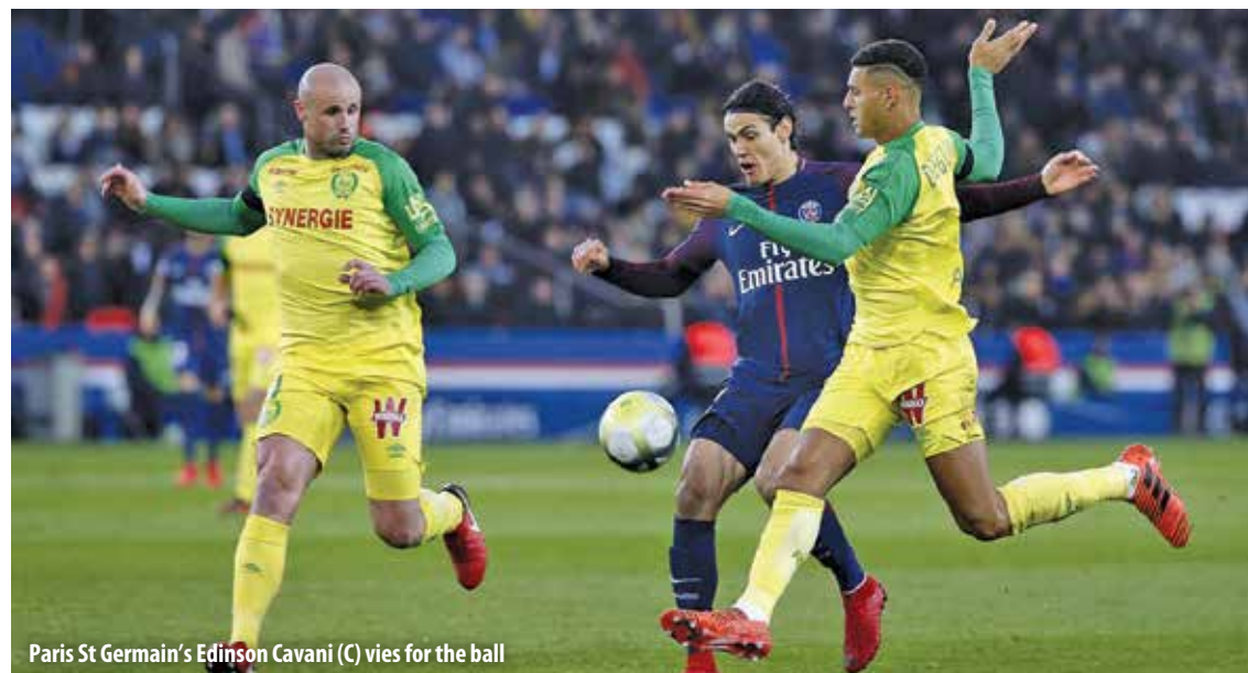
Paris St Germain's Edinson Cavani (C) vies for the ball

Paris Edinson Cavani maintained his prolific goalscoring form with two more as Paris St Germain beat Nantes 4-1 to extend their lead at the top of Ligue 1.