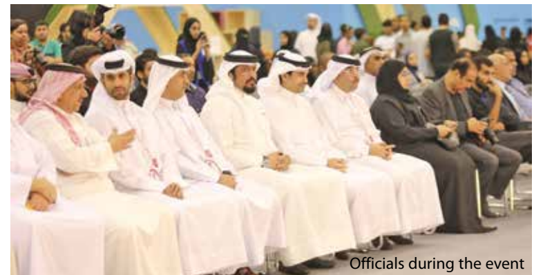
Officials during the event