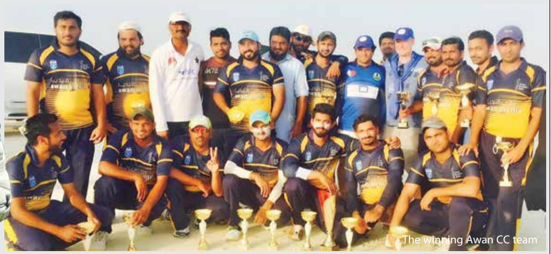
The winning Awan CC team

BDS Bassali in reply were dismissed for 125 with Safdar (24) the main scorer and Ali (three for 23) and Sameer (three for 28) the pick of the bowlers to clinch the trophy.