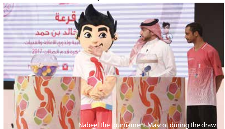
Nabeel the tournament mascot during the draw