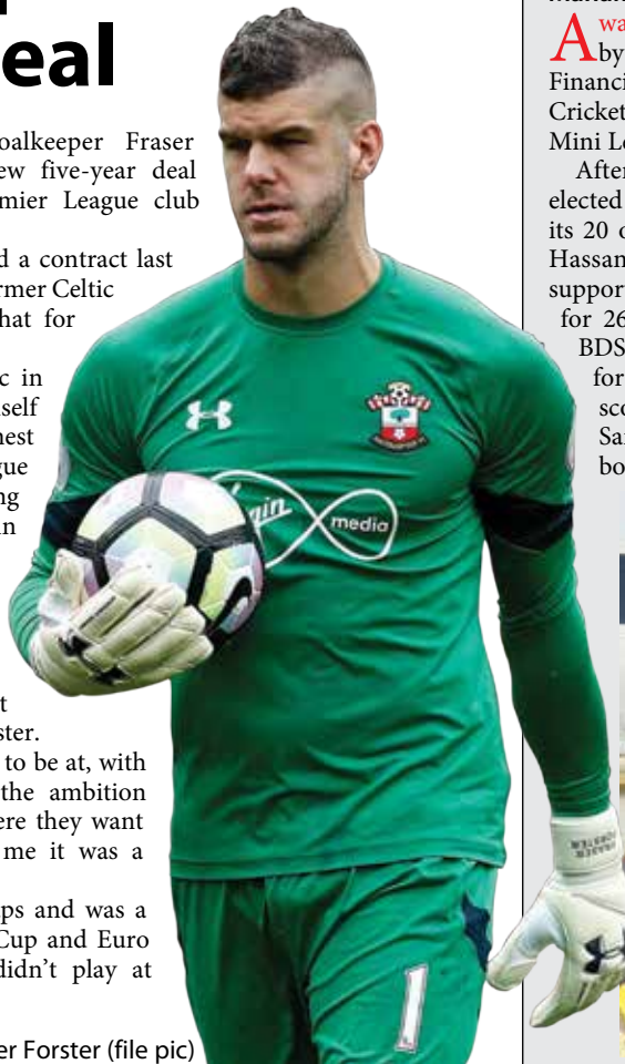
Fraser Forster (file pic)

Forster has six England caps and was a member of the 2014 World Cup and Euro 2016 squads, although he didn't play at either tournament. (AFP)