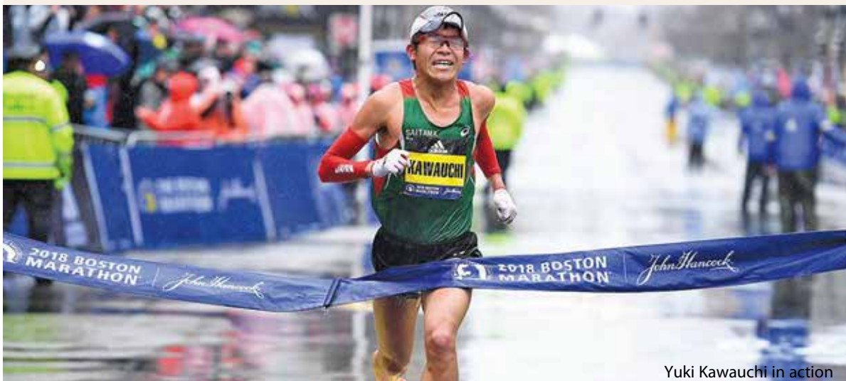
Yuki Kawauchi in action