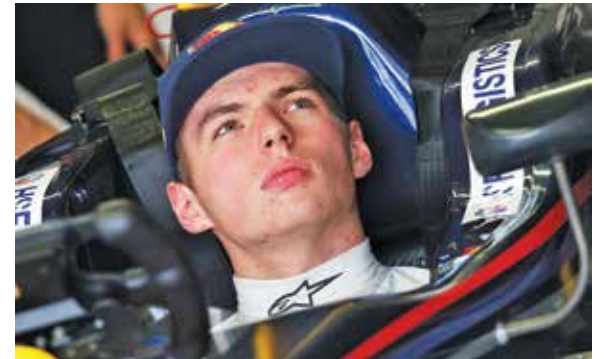
Max Verstappen (file pic)

He wiped out team-mate Mark Webber in Turkey and