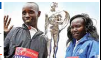
Kenya's Daniel Wanjiru and Mary Keitany, winners of men's and women's elite races in 2017, compete again this year